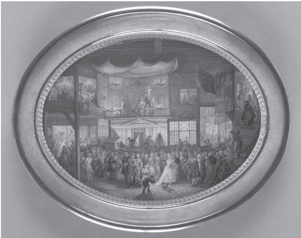
Figure 13.1 Louis-Nicolas van Blarenberghe (1716–1794), The Fair of Saint-Germain , 1763. Miniature, painted on vellum. Note the parade being performed on the balcony above the theatre entrance.

The purpose of your classes with me is not the authentic archaeological reconstruction of the Italian theatre of masks but mastering the fundamentals of its stage technique, which will help you work out your own individual artistic modes of theatrical expression.